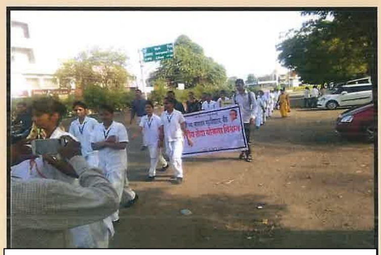
International Suicide awareness program 10/09/2018