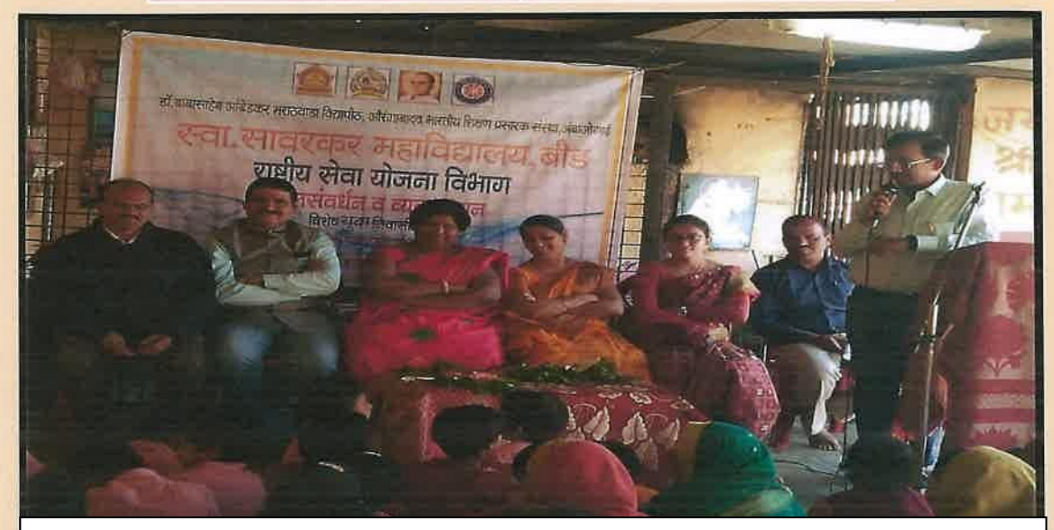
Women's Health Check Up Camp at Wybhatwadi village, 4 Jan., 2019