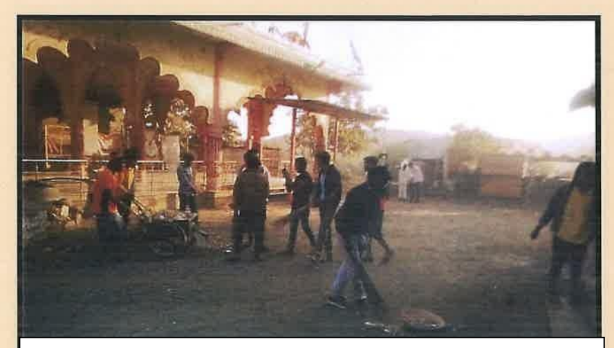
Cleanliness drive at Village Wybhatwadi ,3-9 January, 2019