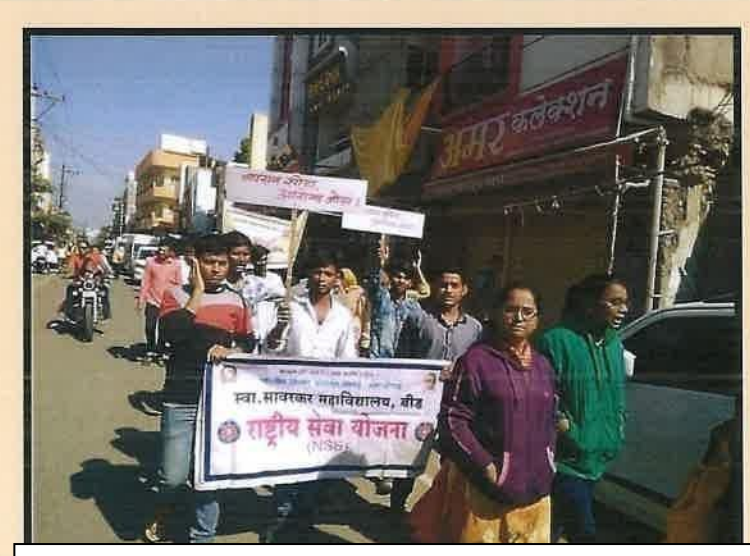
AIDS Awareness Program & Rally 1 December, 2018