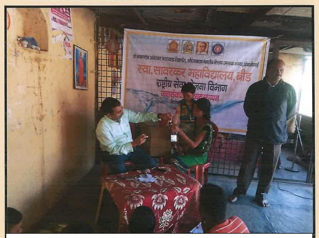
Child Health Check Up Camp at village Wybhatwadi 4 Jan., 2019